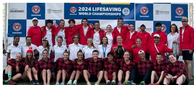
Canadian athletes and coaches at the 2024 Lifesaving World Championships at Broadbeach, City of Gold Coast, Queensland, Australia.

On the national and international stage, Ontario athletes represented the province with pride and excellence. At the Orange Cup in Rotterdam, Ontario was represented by one athlete, one official and a manager. For the Lifesaving World Championships, Ontario contributed a delegation of 14 athletes, 11 officials and six support personnel. Lifesaving Society Ontario also provided essential equipment support for Canadians in the National Team and Interclub championships.